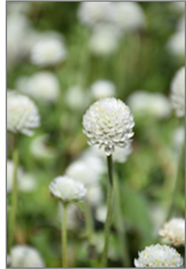
Ping Pong White Globe Amaranth flowers

Ping Pong White Globe Amaranth is recommended for the following landscape applications;