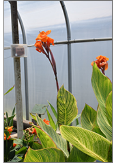
Bengal Tiger Canna flowers

This plant should only be grown in full sunlight. It requires an evenly moist well-drained soil for optimal growth, but will die in standing water. It may require supplemental watering during periods of drought or extended heat. It is not particular as to soil pH, but grows best in rich soils. It is highly tolerant of urban pollution and will even thrive in inner city environments, and will benefit from being planted in a relatively sheltered location. Consider applying a thick mulch around the root zone in winter to protect it in exposed locations or colder microclimates. This particular variety is an interspecific hybrid. It can be propagated by division; however, as a cultivated variety, be aware that it may be subject to certain restrictions or prohibitions on propagation.