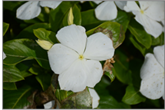
Cora XDR White flowers

Cora XDR White is recommended for the following landscape applications;