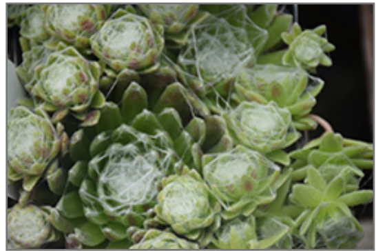
Cobweb Buttons Hens And Chicks