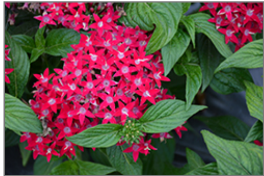
Lucky Star Raspberry Star Flower flowers

Lucky Star Raspberry Star Flower is recommended for the following landscape applications;