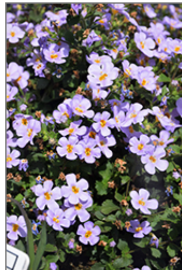
Snowstorm Glacier Blue Bacopa flowers

This beautiful selection features small powder blue flowers with golden centers; its trailing habit makes it ideal for ground covering, border planting, hanging baskets and patio containers; will bloom all season long; fairly low maintenance