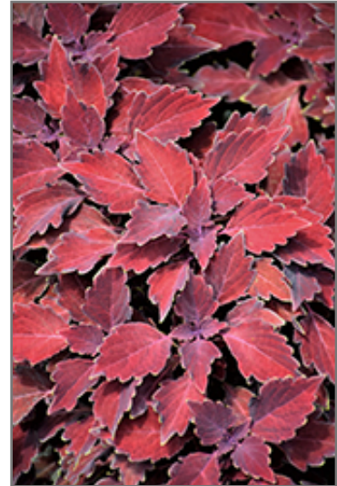
ColorBlaze Royale Cherry Brandy Coleus foliage

ColorBlaze Royale Cherry Brandy Coleus is recommended for the following landscape applications;