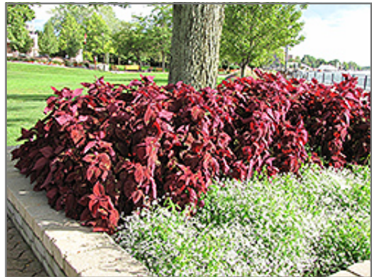
ColorBlaze Rediculous Coleus