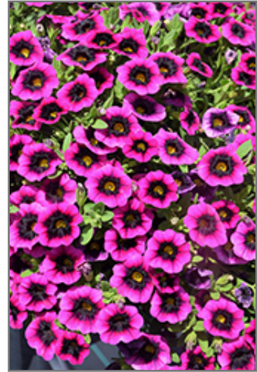
Superbells Blackcurrent Punch Calibrachoa flowers

Superbells Blackcurrent Punch Calibrachoa is recommended for the following landscape applications;