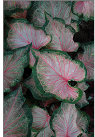
Heart to Heart Chinook Caladium foliage

Heart to Heart Chinook Caladium is recommended for the following landscape applications;