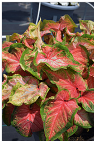
Heart to Heart Chinook Caladium foliage