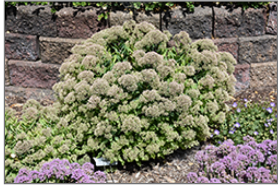
Powderpuff Stonecrop in bloom

Powderpuff Stonecrop is a fine choice for the garden, but it is also a good selection for planting in outdoor pots and containers. It is often used as a 'filler' in the 'spiller-thriller-filler' container combination, providing a mass of flowers and foliage against which the thriller plants stand out. Note that when growing plants in outdoor containers and baskets, they may require more frequent waterings than they would in the yard or garden.