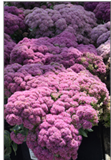
Powderpuff Stonecrop flowers