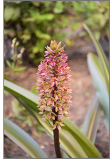
African Night Pineapple Lily flower buds

African Night Pineapple Lily is recommended for the following landscape applications;