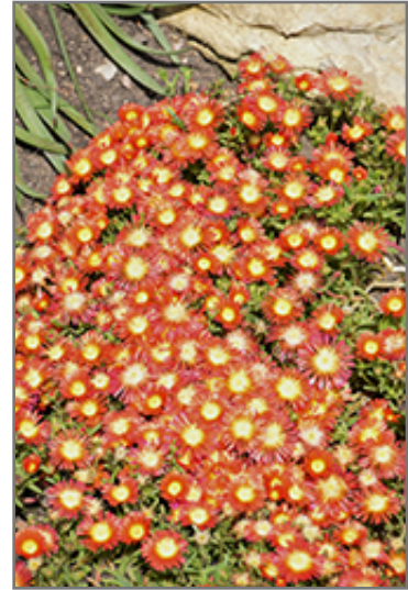
Delmara Red Ice Plant

This is a relatively low maintenance plant, and is best cleaned up in early spring before it resumes active growth for the season. It is a good choice for attracting bees and butterflies to your yard. It has no significant negative characteristics.