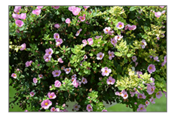
MegaCopa Pink Bacopa flowers