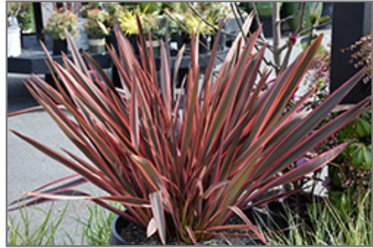
Rainbow Chief New Zealand Flax

Rainbow Chief New Zealand Flax is recommended for the following landscape applications;