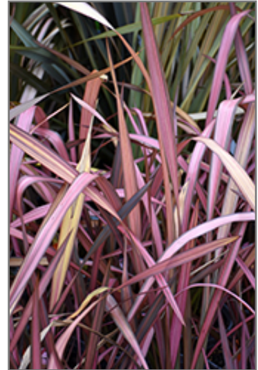
Evening Glow New Zealand Flax foliage