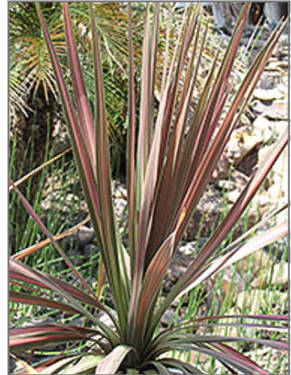
Pink Stripe Cabbage Palm