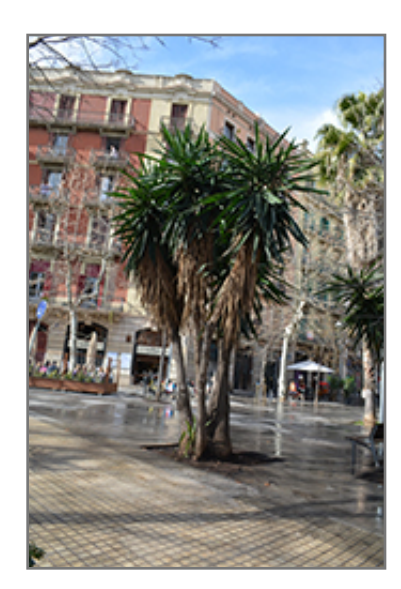
Cabbage Palm