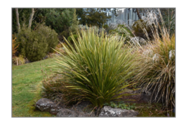
Cabbage Palm