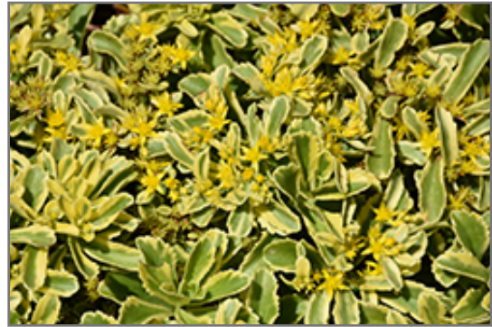
Cutting Edge Stonecrop flowers