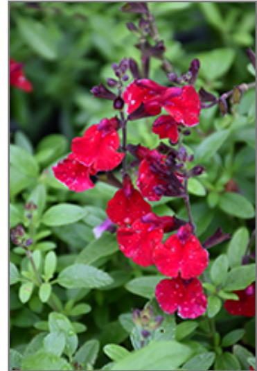
Mirage Cherry Red Autumn Sage flowers

This is a relatively low maintenance plant, and should only be pruned after flowering to avoid removing any of the current season's flowers. It is a good choice for attracting bees, butterflies and hummingbirds to your yard, but is not particularly attractive to deer who tend to leave it alone in favor of tastier treats. It has no significant negative characteristics.