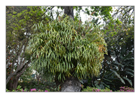
Staghorn Fern