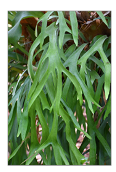
Staghorn Fern foliage