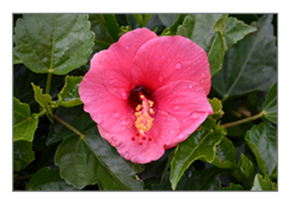
Tradewinds Tortuga Wind Hibiscus flowers

This plant is native to the tropics and prefers growing in moist environments with evenly warm conditions all year round. In our climate, it is usually grown as an outdoor annual in the garden or in a container. If you want it to survive the winter, it can be brought in to the house and provided with special care, and then returned to the garden the following season. In its preferred tropical habitat, as a shrub it can grow to be around 15 feet tall at maturity, with a spread of 10 feet. However, when grown as an annual or when overwintered indoors, it can be expected to perform quite differently, and its exact height and spread will depend on many factors; you may wish to consult with our experts as to how it might perform in your specific application and growing conditions.