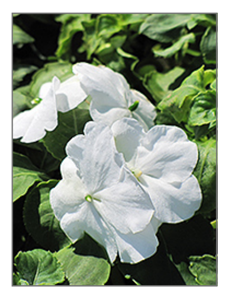
Accent White Impatiens flowers

This series features high quality blooms on vigorous plants that withstand environmental stresses; perfect for shaded beds, borders, and patio containers