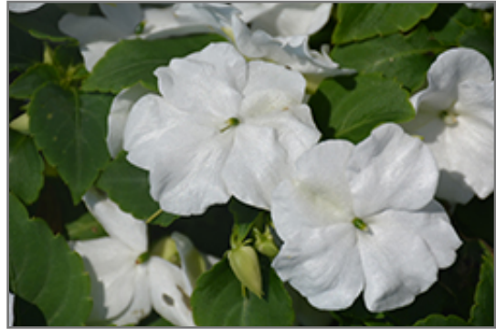
Accent Premium White Impatiens flowers

Accent Premium White Impatiens is recommended for the following landscape applications;