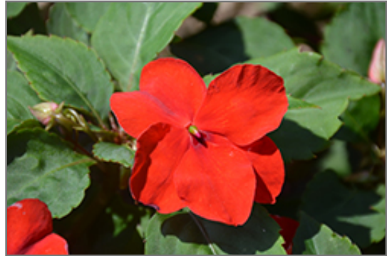
Accent Premium Red Impatiens flowers

Accent Premium Red Impatiens is recommended for the following landscape applications;