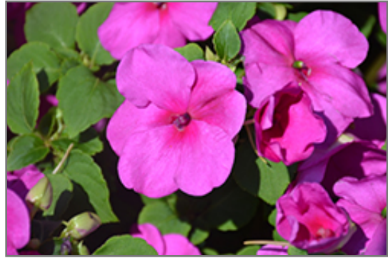
Accent Premium Lilac Impatiens flowers