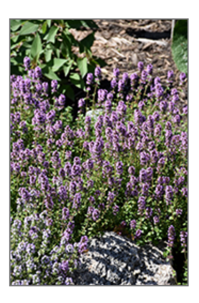
Oregano Thyme in bloom