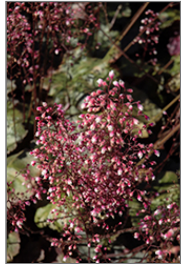
Frosted Violet Coral Bells flowers