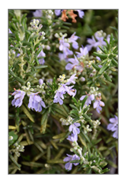
Huntington Carpet Rosemary flowers