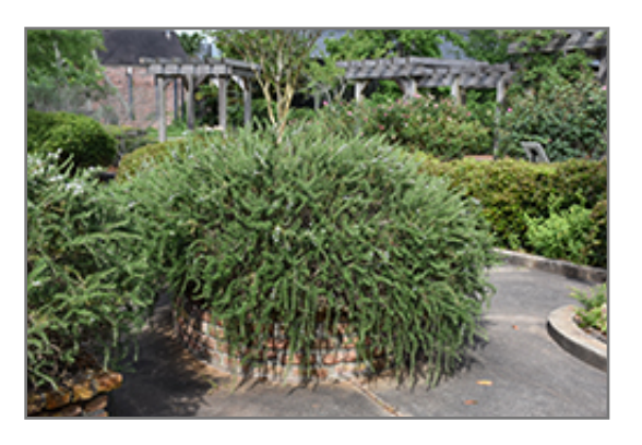
Huntington Carpet Rosemary

Huntington Carpet Rosemary features dainty spikes of lightly-scented blue flowers at the ends of the branches in early spring. It has attractive green evergreen foliage. The fragrant needles are highly ornamental and remain green throughout the winter.