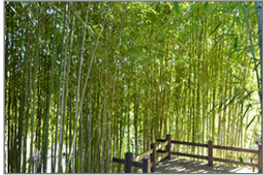
Golden Bamboo