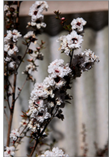
Snow White Tea-Tree flowers