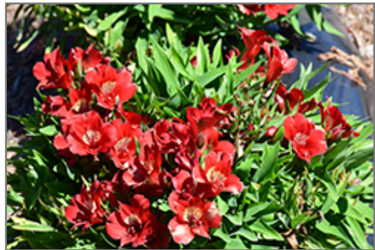
Colorita Kate Alstroemeria in bloom