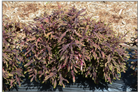
Under The Sea Lion Fish Coleus