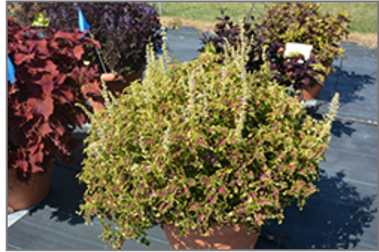
Under The Sea Electric Coral Coleus

Under The Sea Electric Coral Coleus will grow to be about 20 inches tall at maturity, with a spread of 24 inches. When grown in masses or used as a bedding plant, individual plants should be spaced approximately 20 inches apart. It grows at a fast rate, and under ideal conditions can be expected to live for approximately 5 years. As an evergreen perennial, this plant will typically keep its form and foliage year-round.