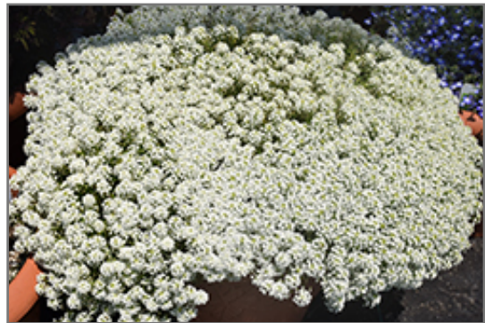
Snow Globe Alyssum in bloom