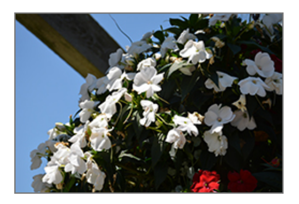
Infinity White New Guinea Impatiens flowers