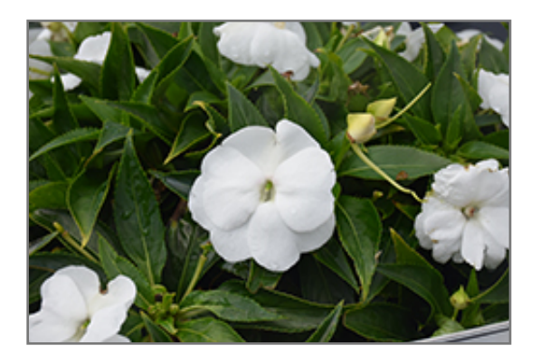
Infinity White New Guinea Impatiens flowers