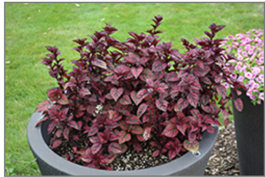
Hippo Red Polka Dot Plant