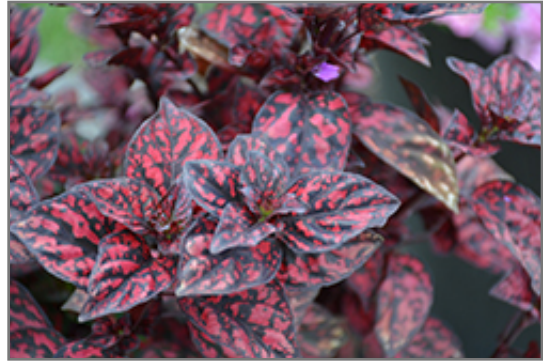
Hippo Red Polka Dot Plant foliage

Hippo Red Polka Dot Plant is recommended for the following landscape applications;