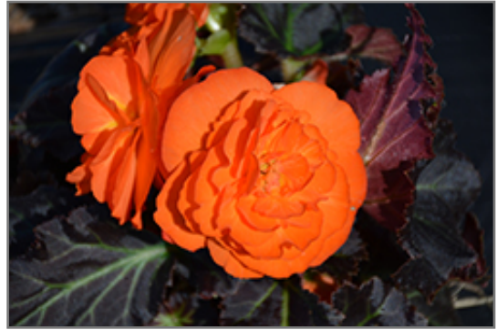
Nonstop Mocca Bright Orange Begonia flowers

Nonstop Mocca Bright Orange Begonia is recommended for the following landscape applications;