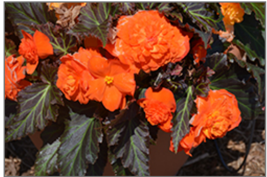
Nonstop Mocca Bright Orange Begonia flowers