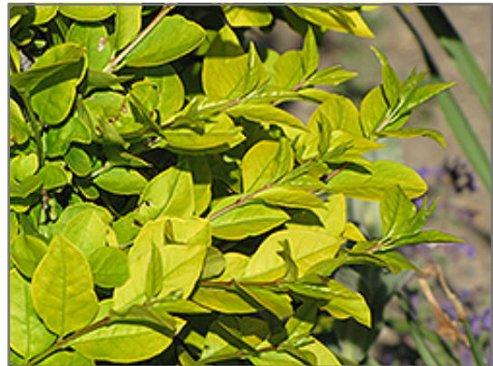
Golden Privet foliage