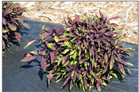
Fancy Feathers Black Coleus