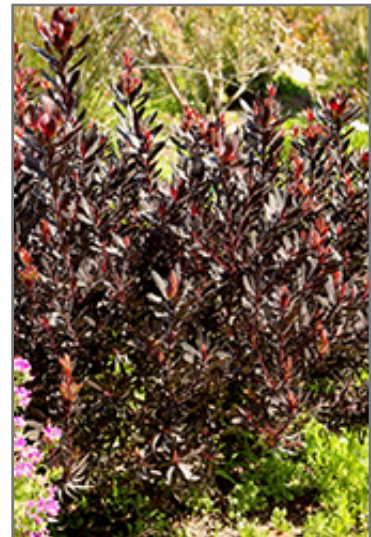
Ebony Conebush