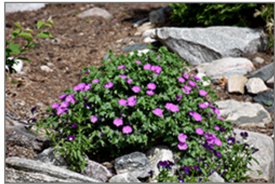
Bloody Cranesbill in bloom