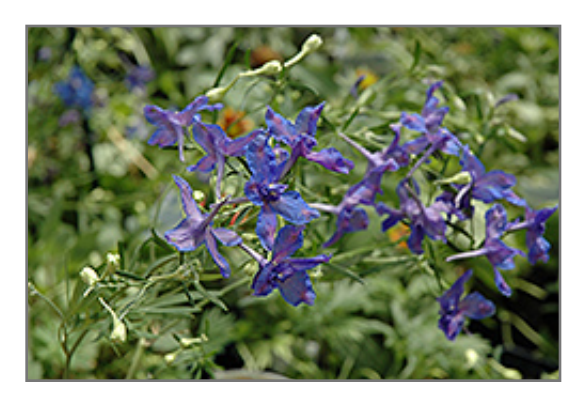
Blue Butterfly Delphinium flowers

Blue Butterfly Delphinium is recommended for the following landscape applications;