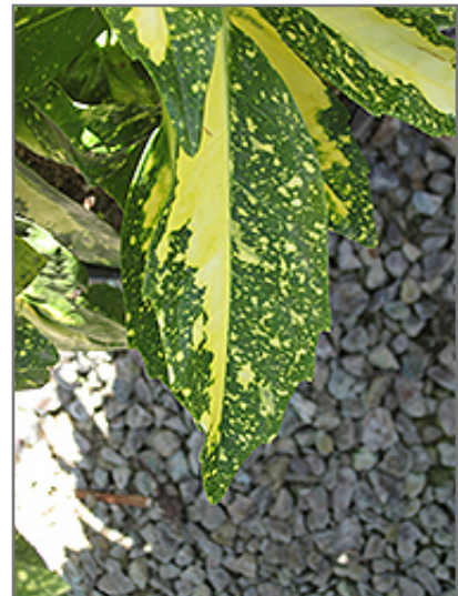
Variegated Japanese Aucuba foliage