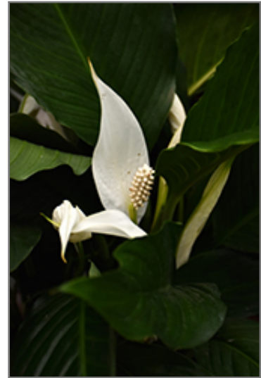
Peace Lily flowers