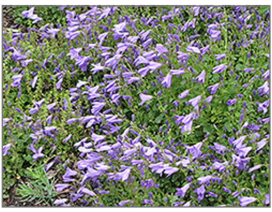
Birch Hybrid Bellflower in bloom