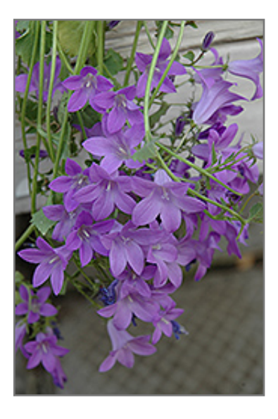
Birch Hybrid Bellflower flowers

Birch Hybrid Bellflower is recommended for the following landscape applications;