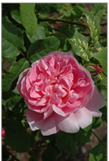
Cottage Rose flowers