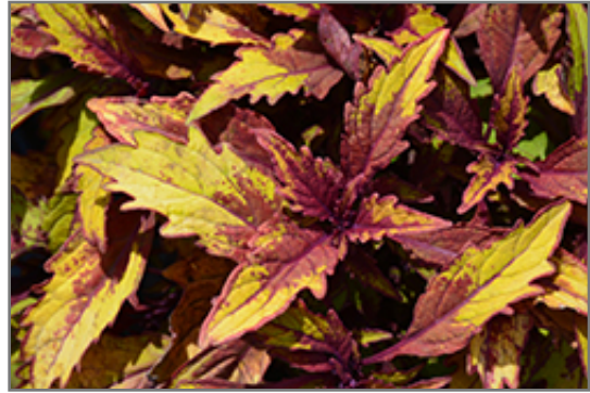
FlameThrower Spiced Curry Coleus foliage

FlameThrower Spiced Curry Coleus is recommended for the following landscape applications;