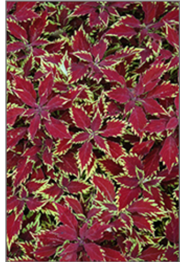
ColorBlaze Royale Apple Brandy Coleus foliage

ColorBlaze Royale Apple Brandy Coleus is recommended for the following landscape applications;